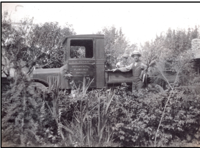
Frank's grandfather and uncle with the truck purchased at the Soquel Garage in 1925.